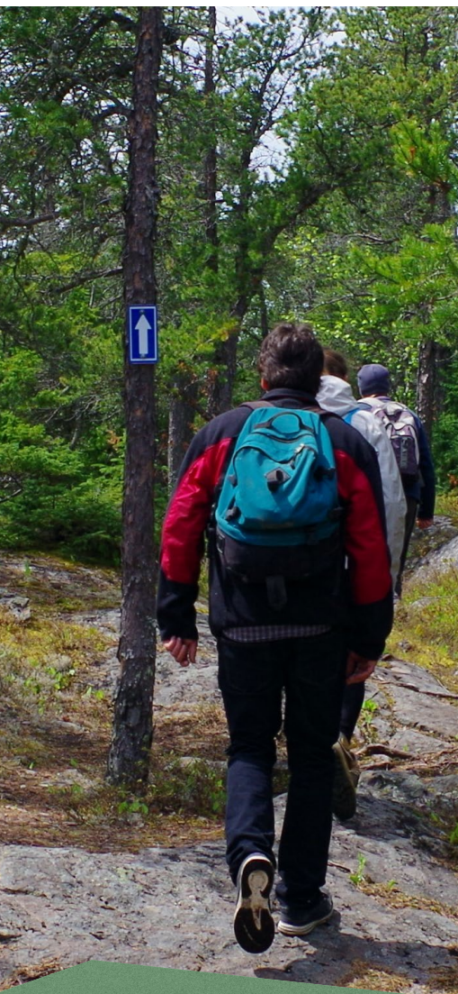
Falcon Trail